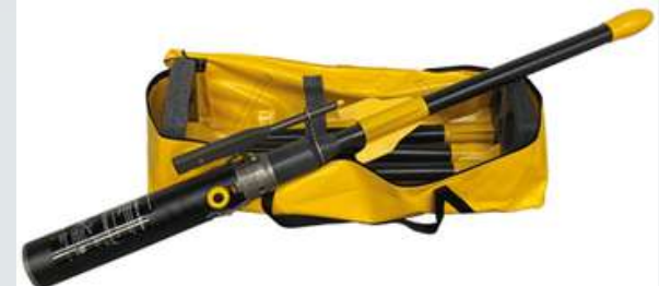
PNEUMATIC MARINE DISTRESS-SIGNALS