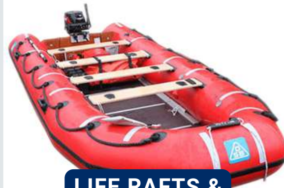
LIFE RAFTS & RESCUE BOATS