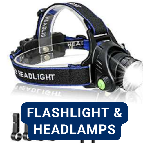
FLASHLIGHT & HEADLAMPS