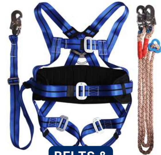
BELTS & SAFETY HARNESSES