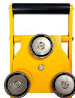
PILOT LADDER MAGNETS