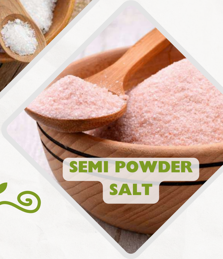
SEMI POWDER SALT